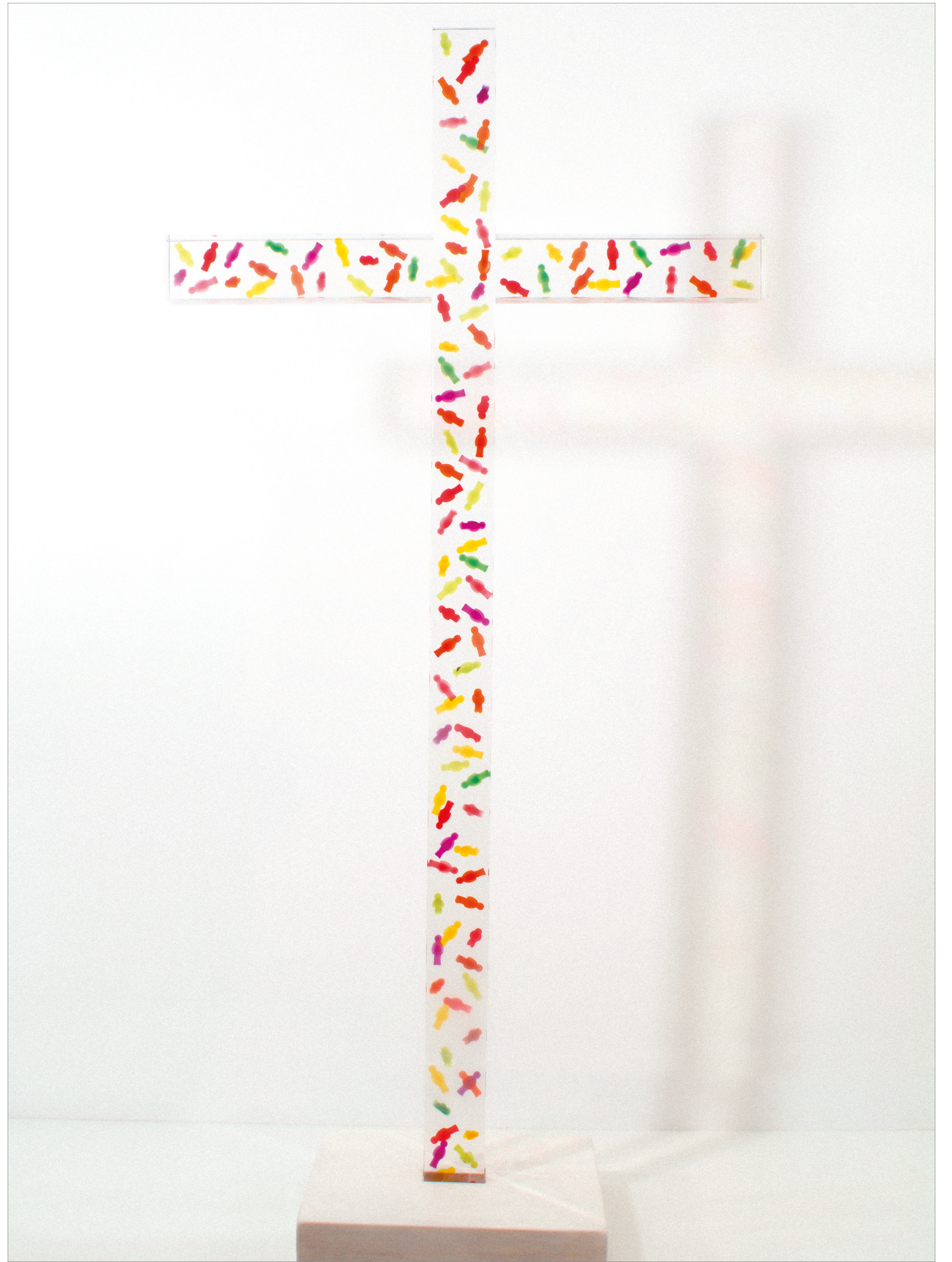
Mauro Perucchetti. Cloning and Religion . 2002. Pigmented & clear urethane resin. 81.5 x 39.5 in.