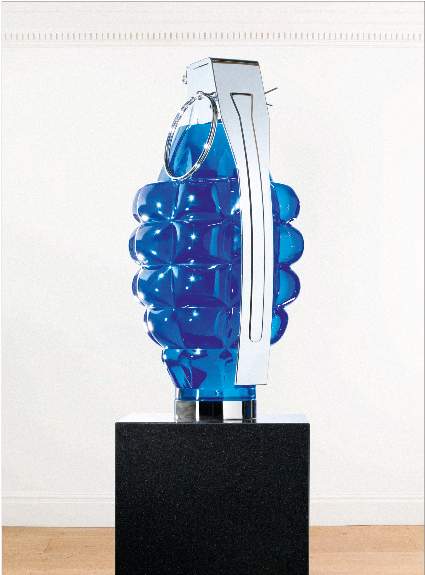
Mauro Perucchetti. POW . 2008. Pigmented resin, chromed brass on granite. 75 x 27.5 x 23.5 in.