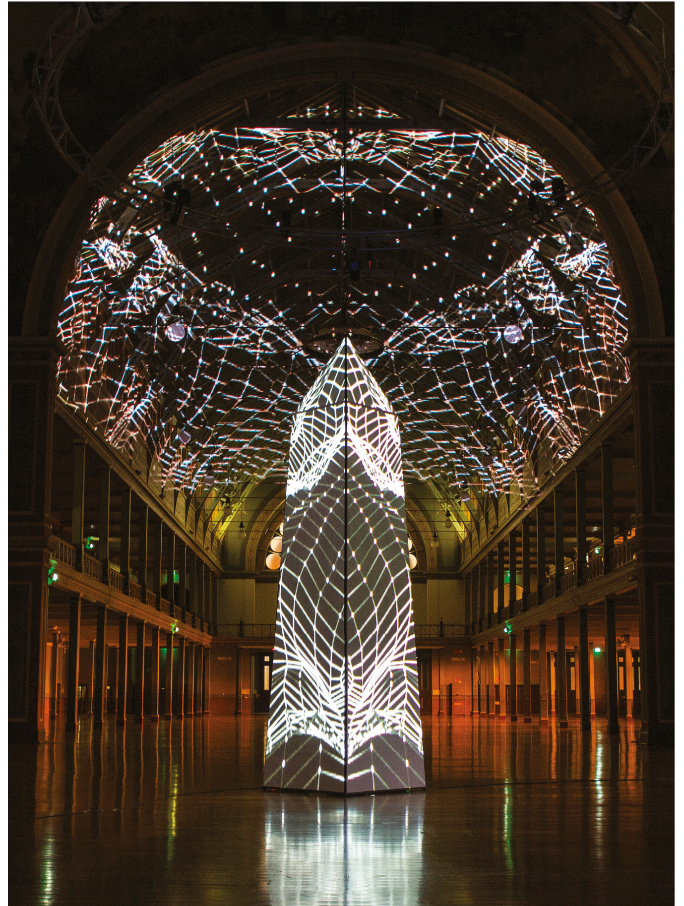
Kit Webster. Obelisk . 2016. Live mapped Obelisk and building projections. Construction: Simon Lansell. Virgin Australia Grand Showcase Featuring Dion Lee.