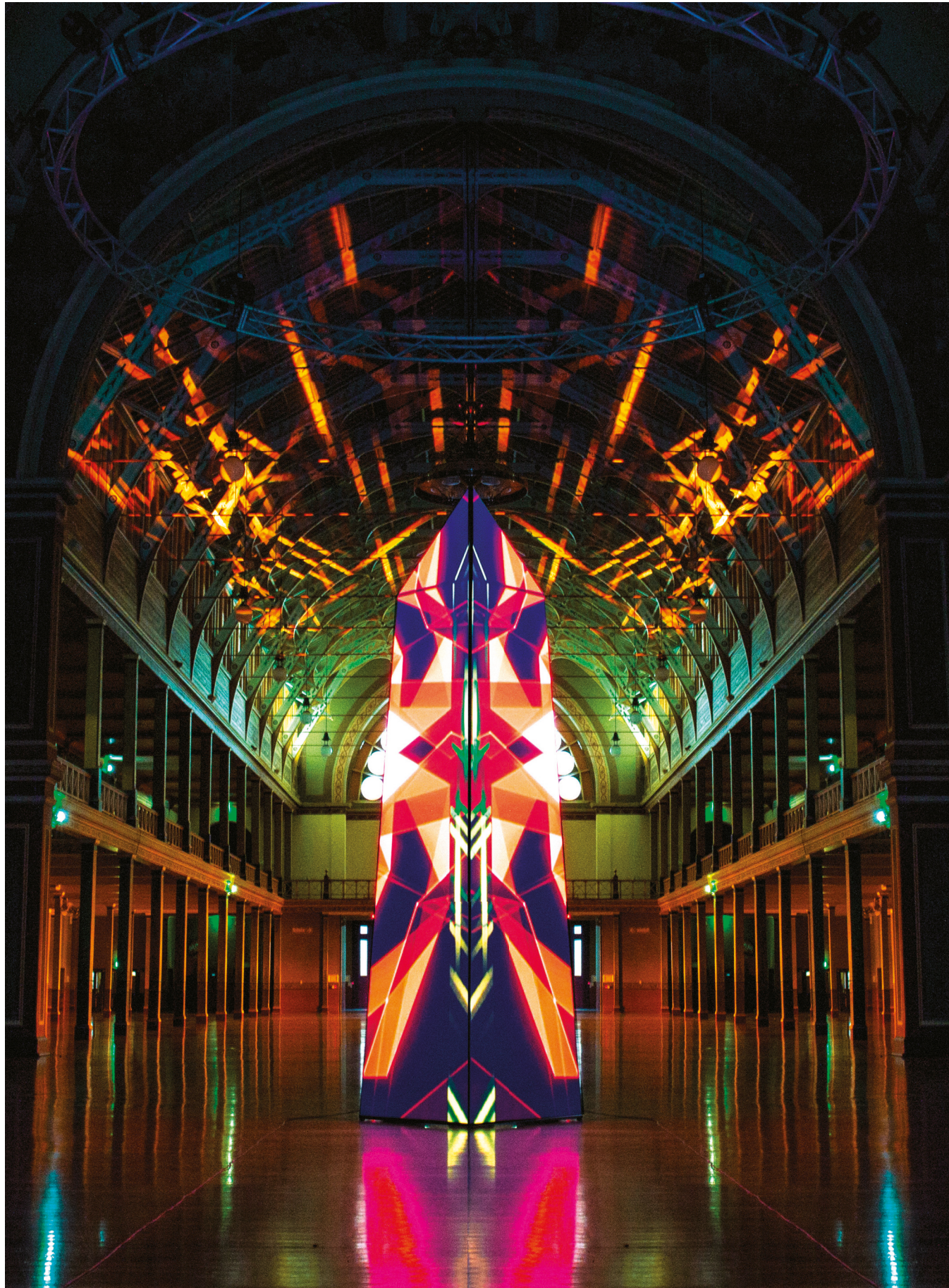
Kit Webster. Obelisk . 2016. Live mapped Obelisk and building projections. Construction: Simon Lansell. Virgin Australia Grand Showcase Featuring Dion Lee.