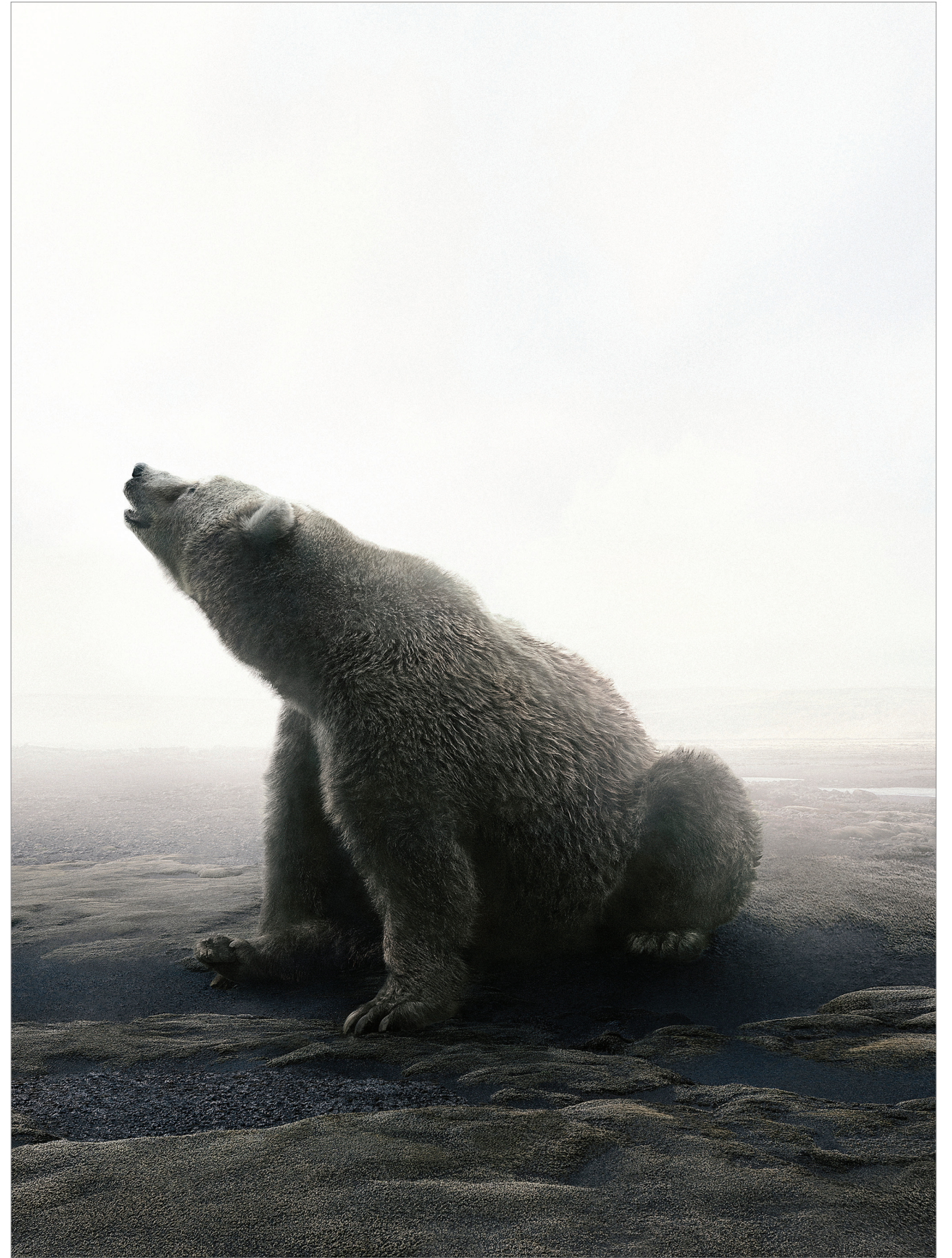
Alice Zilberberg. Bear with it . 2018. Digital Painting. 40 x 44 in.