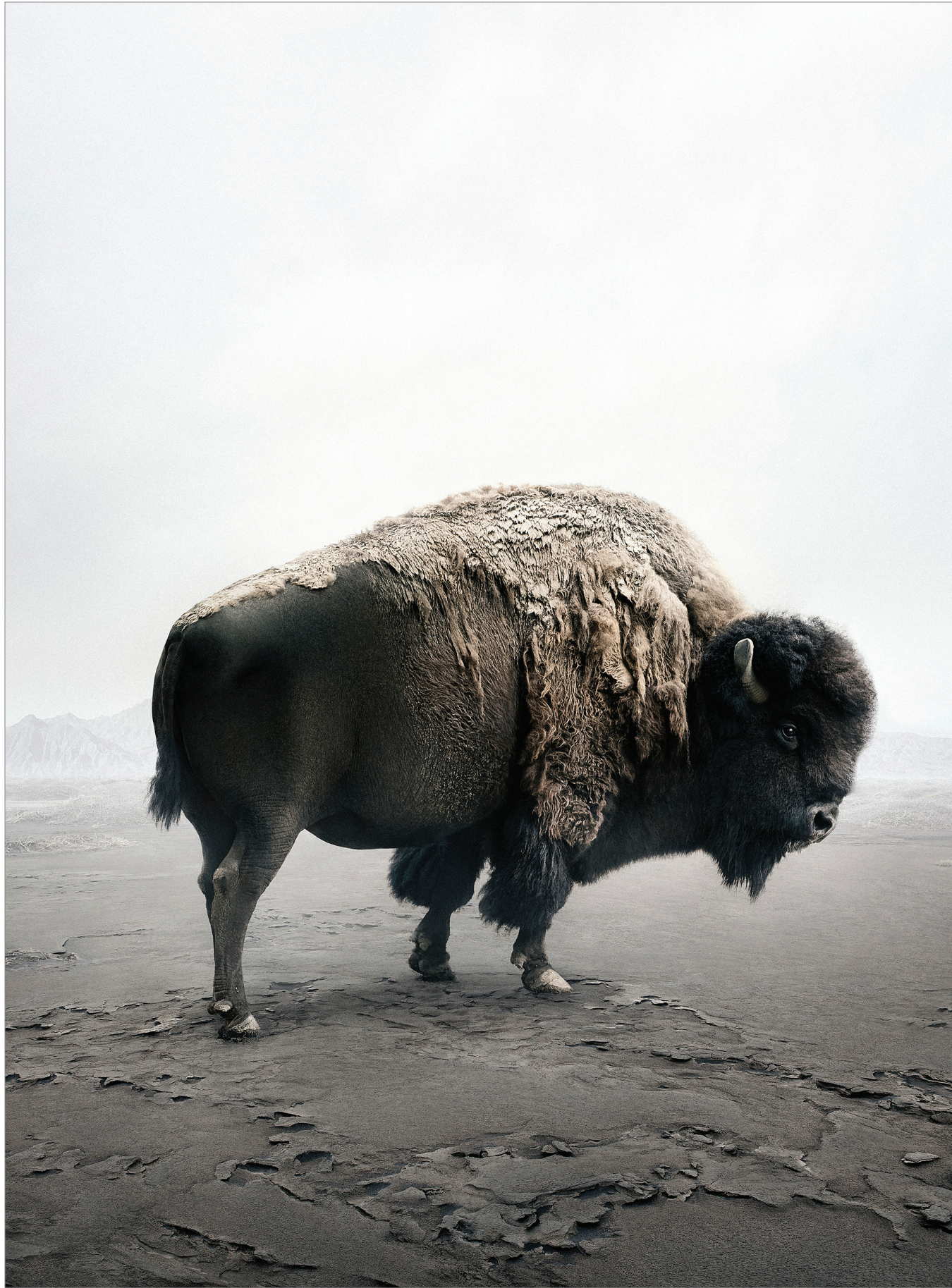
Alice Zilberberg. Be Here Bison . 2018. Digital Painting. 40 x 35 in.