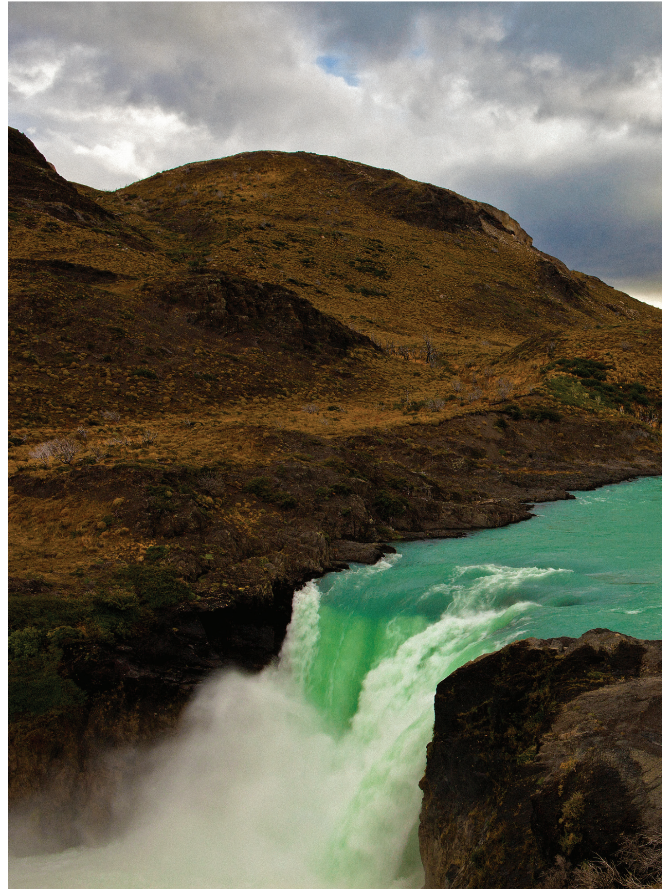
Leo Collazo. A Dusting of Greens and Gold . 2016. Digital photograph. 3000 x 2000 px.